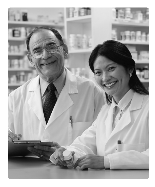
The Rx Choice network contains 57,000 pharmacies nationwide.

With the Rx Choice network, you can purchase your prescription medications from any of 57,000 in-network pharmacies located around the corner and across the country.