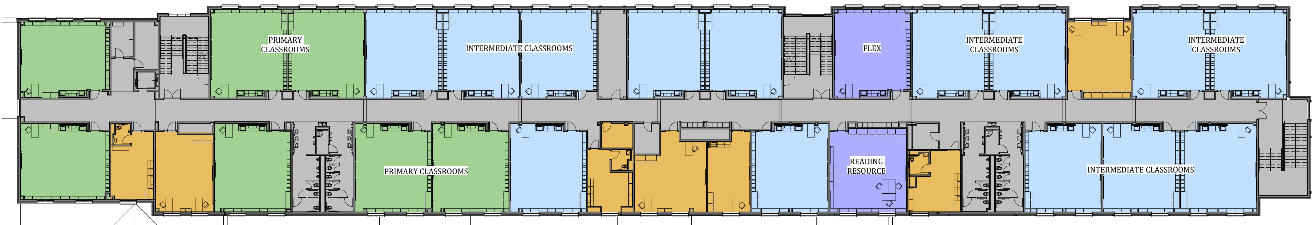
2 SECOND FLOOR - OVERALL 3/64" = 1'-0"